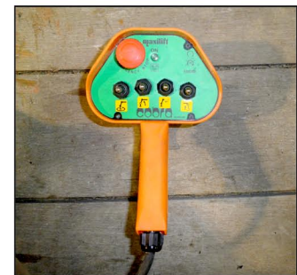
OPTIONAL CORDED CRANE REMOTE

Specifications subject to change without notice or obligation. Printed in Canada 01/14